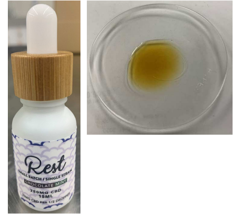
Product of Vermont USA